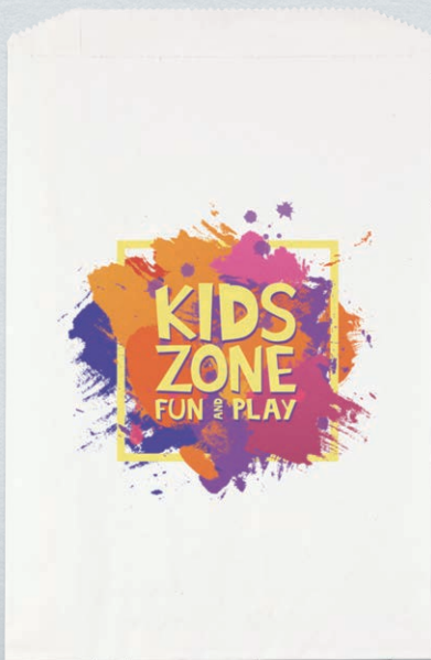
DYNAMIC COLOR 7 X 10