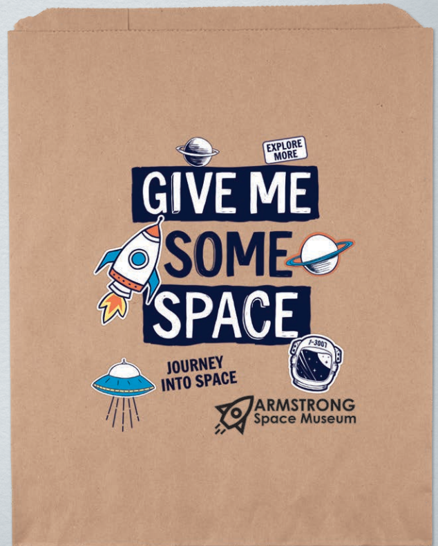
COLOR VISTA 11 X 13 3/4