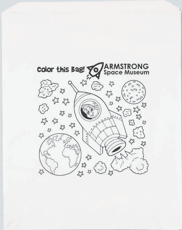
FLEXTONK PRINT 11 X 13 3/4

Unlined white or recycled brown kraft paper Merchandise Bags feature a serrated top and no gusset. Brown kraft paper is made from 100% recycled material with a minimum of 60% post-consumer content.